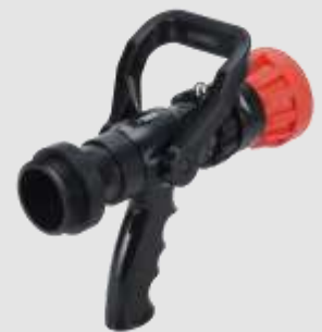
Attack 750 HR Pro Series